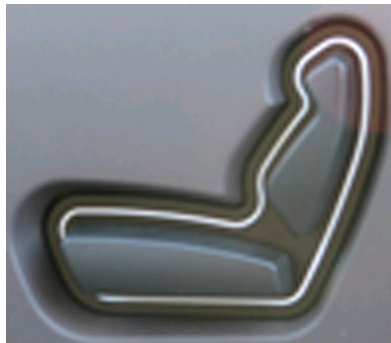
Fig. 1. A seat adjustment control which exhibits excellent natural mapping or matching between the system and the user's mental model

The feedback allows the user to identify what state the system is in. If a performed task has resulted in anything, what task was performed etc. It is very important to allow the operator to recognize if an action had any effect on the system and also what the result of it was [10]. For example, even if a computing task on a PC takes some time to calculate, the operator is informed that the computer is working by a flashing led or an hourglass on the screen.